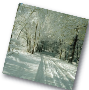
Record Xmas card sales page 6