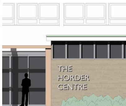
The Full Life Appeal page 4