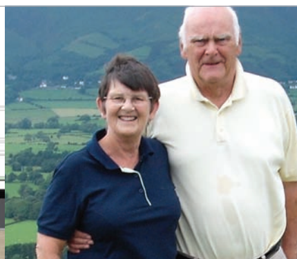
Case Studies page 7