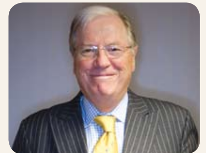
Sir Tim Chessells

It was noted that the Centre's proposed three-phase redevelopment programme, would bring some much needed improvements to the fabric of the building and significant service improvement.