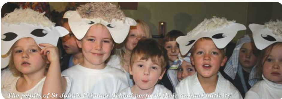
The pupils of St John's Primary School perform their annual nativity

Last year the club scooped the Under 9s Sportsmanship Award from the Crowborough League, the only award handed out in the club's division.