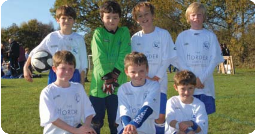
New kit: Langton Green Under 10s show off their new strip