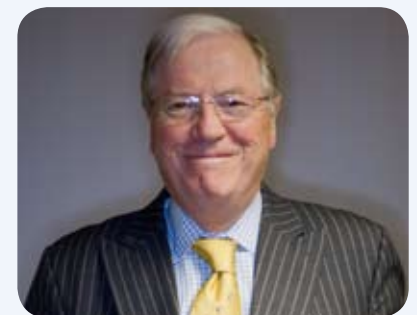
Sir Tim Chessells

It was noted that the Centre's proposed three-phase redevelopment programme, would bring some much needed improvements to the fabric of the building and significant service improvement.