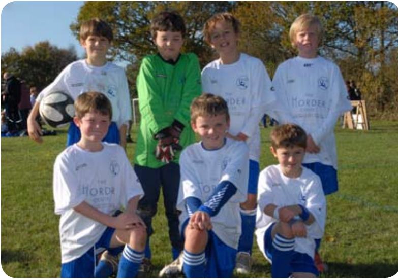
New kit: Langton Green Under 10s show off their new strip